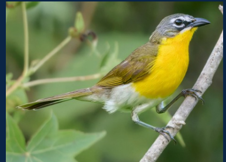
Yellow-breasted Chat

The graphs presented on this page illustrate the probability that a species will occur within a block based on the values of significant environmental variables for that block in the Second Atlas species' distribution models. Probability of occurrence ranges from 0 to 1 (vertical axis). Depending on the graph, the horizontal axis depicts 1) the percentage of a block covered by a habitat type (e.g., grassland and shrubland) or 2) a value from low to high for climate variables (e.g., mean annual rainfall) and landscape-level features (e.g., diversity of habitat types) within a block. The dark line indicates the relationship between occurrence and the variable. There is a 95% probability (confidence interval) that this relationship falls between the gray lines. The black tick marks at the bottom of the graph show where individual blocks fall on the horizontal axis, to demonstrate the spread of values for the blocks in the model.