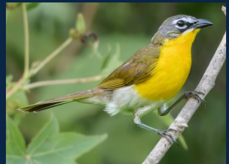
Yellow-breasted Chat

The graphs presented on this page illustrate the probability that a species will occur within a block based on the values of significant environmental variables for that block in the Second Atlas species' distribution models. Probability of occurrence ranges from 0 to 1 (vertical axis). Depending on the graph, the horizontal axis depicts 1) the percentage of a block covered by a habitat type (e.g., grassland and shrubland) or 2) a value from low to high for climate variables (e.g., mean annual rainfall) and landscape-level features (e.g., diversity of habitat types) within a block. The dark line indicates the relationship between occurrence and the variable. There is a 95% probability (confidence interval) that this relationship falls between the gray lines. The black tick marks at the bottom of the graph show where individual blocks fall on the horizontal axis, to demonstrate the spread of values for the blocks in the model.