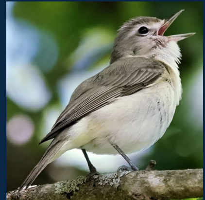
Warbling Vireo

The graphs presented on this page illustrate the probability that a species will occur within a block based on the values of significant environmental variables for that block in the Second Atlas species' distribution models. Probability of occurrence ranges from 0 to 1 (vertical axis). Depending on the graph, the horizontal axis depicts 1) the percentage of a block covered by a habitat type (e.g., grassland and shrubland) or 2) a value from low to high for climate variables (e.g., mean annual rainfall) and landscape-level features (e.g., diversity of habitat types) within a block. The dark line indicates the relationship between occurrence and the variable. There is a 95% probability (confidence interval) that this relationship falls between the gray lines. The black tick marks at the bottom of the graph show where individual blocks fall on the horizontal axis, to demonstrate the spread of values for the blocks in the model.