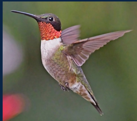
Ruby-throated Hummingbird

The graphs presented on this page illustrate the probability that a species will occur within a block based on the values of significant environmental variables for that block in the Second Atlas species' distribution models. Probability of occurrence ranges from 0 to 1 (vertical axis). Depending on the graph, the horizontal axis depicts 1) the percentage of a block covered by a habitat type (e.g., grassland and shrubland) or 2) a value from low to high for climate variables (e.g., mean annual rainfall) and landscape-level features (e.g., diversity of habitat types) within a block. The dark line indicates the relationship between occurrence and the variable. There is a 95% probability (confidence interval) that this relationship falls between the gray lines. The black tick marks at the bottom of the graph show where individual blocks fall on the horizontal axis, to demonstrate the spread of values for the blocks in the model.