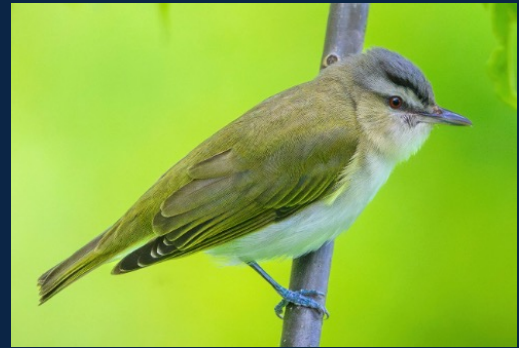
Red-eyed Vireo