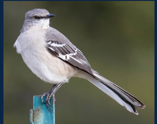
Northern Mockingbird

The graphs presented on this page illustrate the probability that a species will occur within a block based on the values of significant environmental variables for that block in the Second Atlas species' distribution models. Probability of occurrence ranges from 0 to 1 (vertical axis). Depending on the graph, the horizontal axis depicts 1) the percentage of a block covered by a habitat type (e.g., grassland and shrubland) or 2) a value from low to high for climate variables (e.g., mean annual rainfall) and landscape-level features (e.g., diversity of habitat types) within a block. The dark line indicates the relationship between occurrence and the variable. There is a 95% probability (confidence interval) that this relationship falls between the gray lines. The black tick marks at the bottom of the graph show where individual blocks fall on the horizontal axis, to demonstrate the spread of values for the blocks in the model.