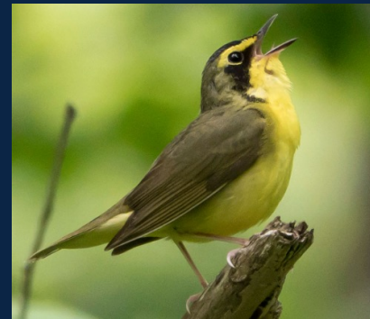
Kentucky Warbler © Dave Boltz