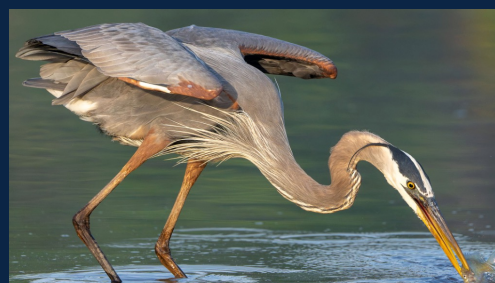
Great Blue Heron

The graphs presented on this page illustrate the probability that a species will occur within a block based on the values of significant environmental variables for that block in the Second Atlas species' distribution models. Probability of occurrence ranges from 0 to 1 (vertical axis). Depending on the graph, the horizontal axis depicts 1) the percentage of a block covered by a habitat type (e.g., grassland and shrubland) or 2) a value from low to high for climate variables (e.g., mean annual rainfall) and landscape-level features (e.g., diversity of habitat types) within a block. The dark line indicates the relationship between occurrence and the variable. There is a 95% probability (confidence interval) that this relationship falls between the gray lines. The black tick marks at the bottom of the graph show where individual blocks fall on the horizontal axis, to demonstrate the spread of values for the blocks in the model.