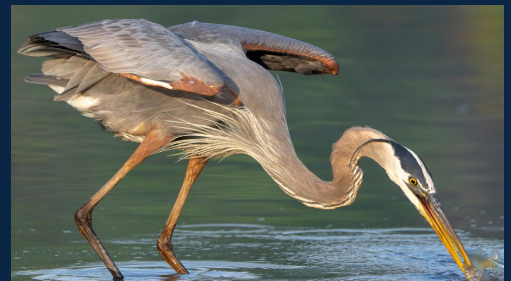
Great Blue Heron

The graphs presented on this page illustrate the probability that a species will occur within a block based on the values of significant environmental variables for that block in the Second Atlas species' distribution models. Probability of occurrence ranges from 0 to 1 (vertical axis). Depending on the graph, the horizontal axis depicts 1) the percentage of a block covered by a habitat type (e.g., grassland and shrubland) or 2) a value from low to high for climate variables (e.g., mean annual rainfall) and landscape-level features (e.g., diversity of habitat types) within a block. The dark line indicates the relationship between occurrence and the variable. There is a 95% probability (confidence interval) that this relationship falls between the gray lines. The black tick marks at the bottom of the graph show where individual blocks fall on the horizontal axis, to demonstrate the spread of values for the blocks in the model.