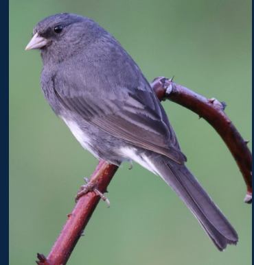
Dark-eyed Junco

The graphs presented on this page illustrate the probability that a species will occur within a block based on the values of significant environmental variables for that block in the Second Atlas species' distribution models. Probability of occurrence ranges from 0 to 1 (vertical axis). Depending on the graph, the horizontal axis depicts 1) the percentage of a block covered by a habitat type (e.g., grassland and shrubland) or 2) a value from low to high for climate variables (e.g., mean annual rainfall) and landscape-level features (e.g., diversity of habitat types) within a block. The dark line indicates the relationship between occurrence and the variable. There is a 95% probability (confidence interval) that this relationship falls between the gray lines. The black tick marks at the bottom of the graph show where individual blocks fall on the horizontal axis, to demonstrate the spread of values for the blocks in the model.