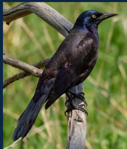
Common Grackle

The graphs presented on this page illustrate the probability that a species will occur within a block based on the values of significant environmental variables for that block in the Second Atlas species' distribution models. Probability of occurrence ranges from 0 to 1 (vertical axis). Depending on the graph, the horizontal axis depicts 1) the percentage of a block covered by a habitat type (e.g., grassland and shrubland) or 2) a value from low to high for climate variables (e.g., mean annual rainfall) and landscape-level features (e.g., diversity of habitat types) within a block. The dark line indicates the relationship between occurrence and the variable. There is a 95% probability (confidence interval) that this relationship falls between the gray lines. The black tick marks at the bottom of the graph show where individual blocks fall on the horizontal axis, to demonstrate the spread of values for the blocks in the model.