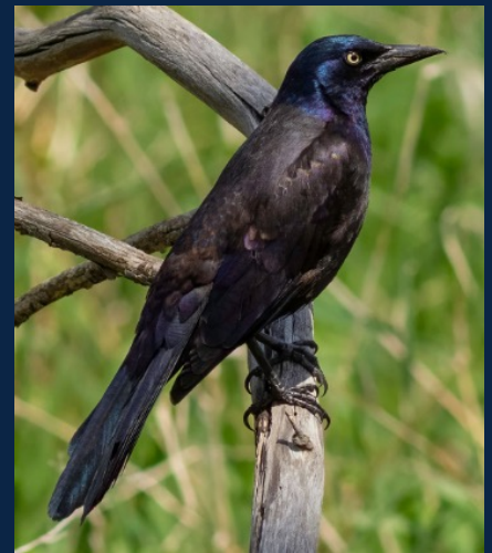
Common Grackle

The graphs presented on this page illustrate the probability that a species will occur within a block based on the values of significant environmental variables for that block in the Second Atlas species' distribution models. Probability of occurrence ranges from 0 to 1 (vertical axis). Depending on the graph, the horizontal axis depicts 1) the percentage of a block covered by a habitat type (e.g., grassland and shrubland) or 2) a value from low to high for climate variables (e.g., mean annual rainfall) and landscape-level features (e.g., diversity of habitat types) within a block. The dark line indicates the relationship between occurrence and the variable. There is a 95% probability (confidence interval) that this relationship falls between the gray lines. The black tick marks at the bottom of the graph show where individual blocks fall on the horizontal axis, to demonstrate the spread of values for the blocks in the model.