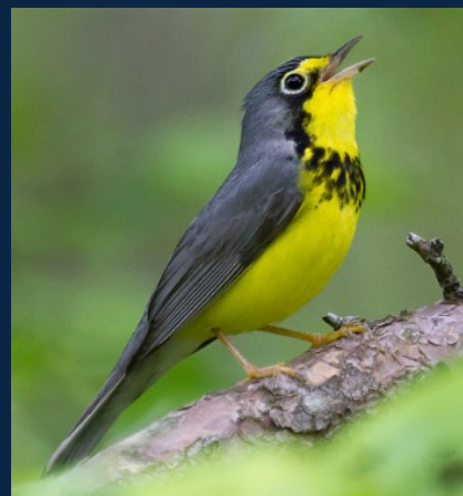
Canada Warbler © Dave Boltz