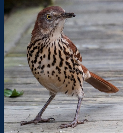
Brown Thrasher