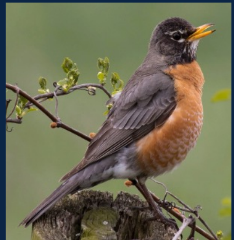
American Robin

The graphs presented on this page illustrate the probability that a species will occur within a block based on the values of significant environmental variables for that block in the Second Atlas species' distribution models. Probability of occurrence ranges from 0 to 1 (vertical axis). Depending on the graph, the horizontal axis depicts 1) the percentage of a block covered by a habitat type (e.g., grassland and shrubland) or 2) a value from low to high for climate variables (e.g., mean annual rainfall) and landscape-level features (e.g., diversity of habitat types) within a block. The dark line indicates the relationship between occurrence and the variable. There is a 95% probability (confidence interval) that this relationship falls between the gray lines. The black tick marks at the bottom of the graph show where individual blocks fall on the horizontal axis, to demonstrate the spread of values for the blocks in the model.