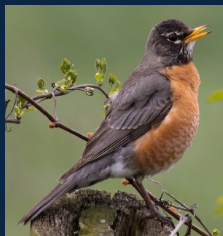
American Robin

The graphs presented on this page illustrate the probability that a species will occur within a block based on the values of significant environmental variables for that block in the Second Atlas species' distribution models. Probability of occurrence ranges from 0 to 1 (vertical axis). Depending on the graph, the horizontal axis depicts 1) the percentage of a block covered by a habitat type (e.g., grassland and shrubland) or 2) a value from low to high for climate variables (e.g., mean annual rainfall) and landscape-level features (e.g., diversity of habitat types) within a block. The dark line indicates the relationship between occurrence and the variable. There is a 95% probability (confidence interval) that this relationship falls between the gray lines. The black tick marks at the bottom of the graph show where individual blocks fall on the horizontal axis, to demonstrate the spread of values for the blocks in the model.