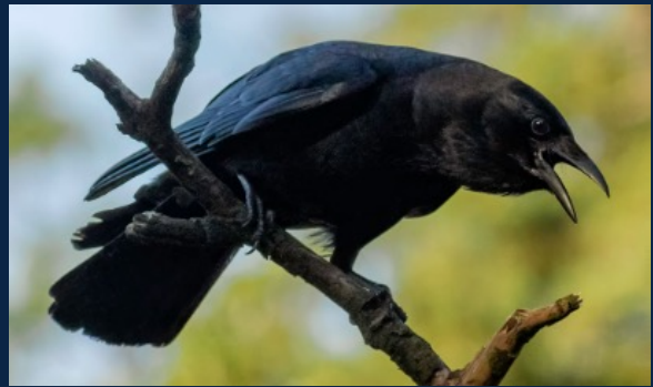
American Crow